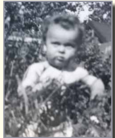
They breed 'em tough on Sheppey!!