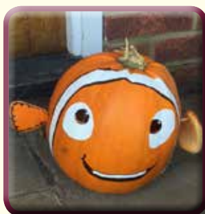
Too many Fireballs for the Captain