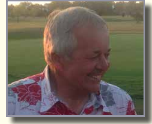
Aloha from The President

this was reflected in the tight margins between the final scores.