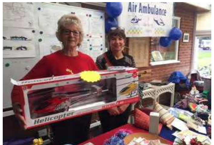
Sue's modelling career seems to be taking off!